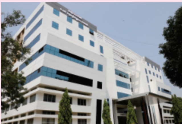
Diamond Jubilee Block Arutchelvar Advanced Technology Centre