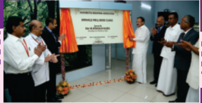
Mirakle Wellness Clinic (Health Care Division of NIA), a centre for alternative therapy, which focuses on curing dreadful diseases such as cancer, heart disease, etc., is being inaugurated.