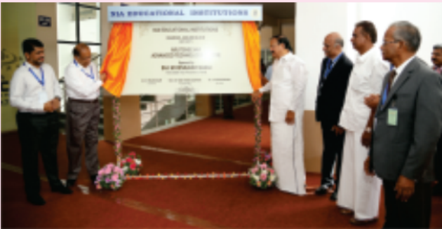
Arutchelvar Advanced Technology Centre, an eight-storey building encompassing Centres of Excellence, Innovative Research Centres, etc. is being inaugurated by Hon'ble Vice President of India.