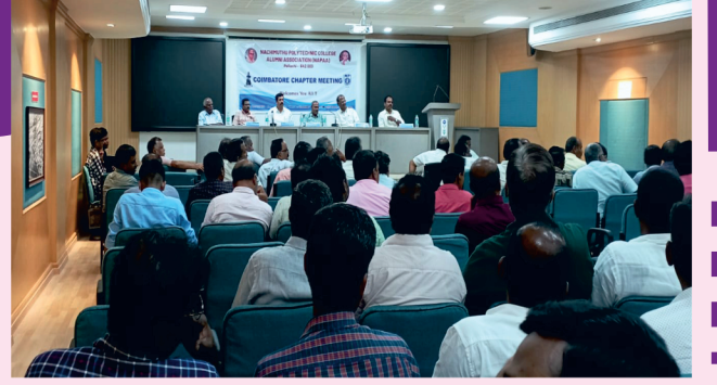
NAPAA Members off the Dias