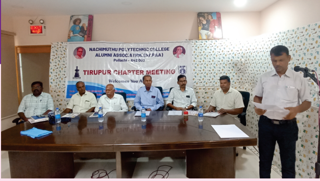
Office Bearers of NAPAA on the Dias