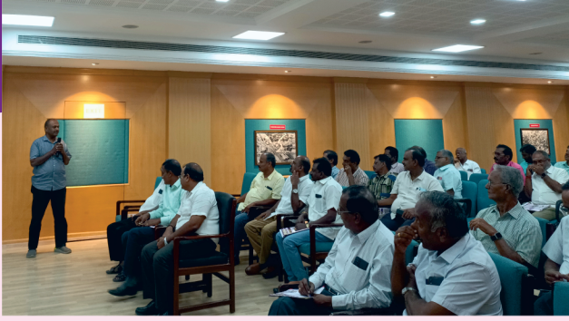
Self Introduction Session