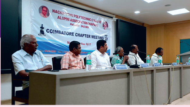
Office Bearers of NAPAA on the Dias