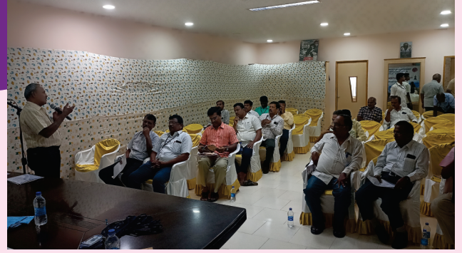
NAPAA Secretary addressing the gathering